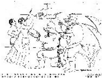
Click for full size picture. (12K)